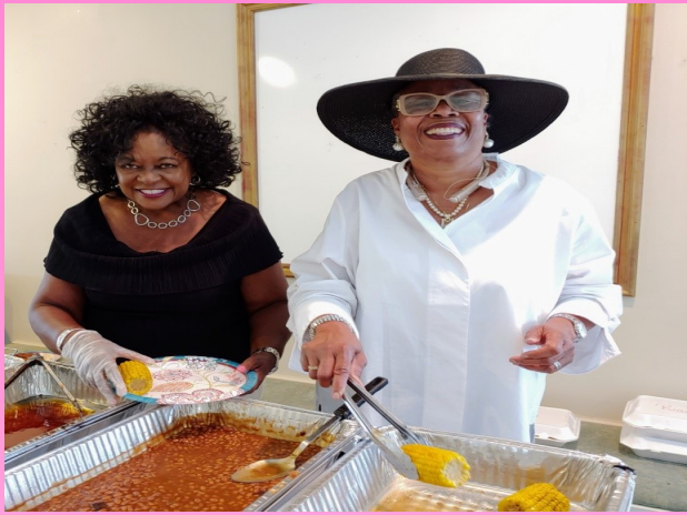
Serving Food Projects