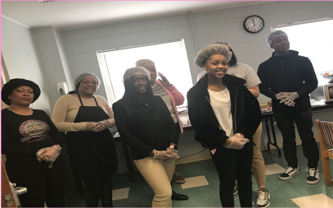
SERVING THE VETS MLK DAY OF SERVICE MAPLE GROVE NURSING HOME