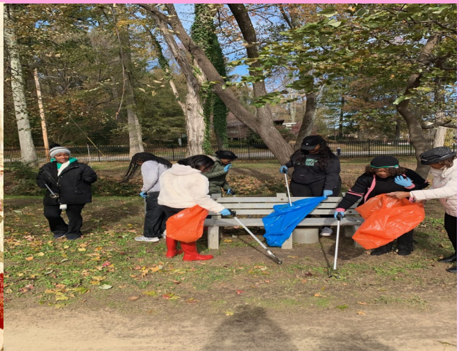
Cleaning the Screams at High Point University