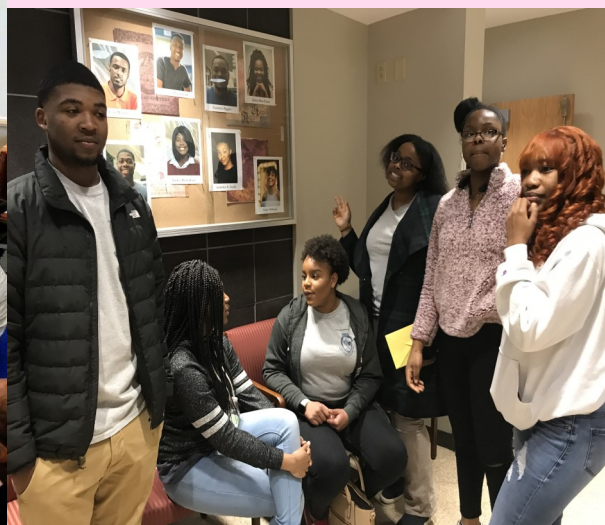
NC A & T State University