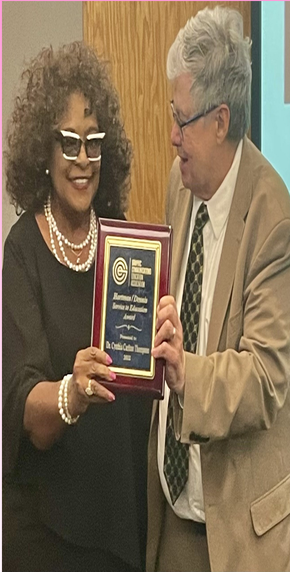
Greensboro News and Record