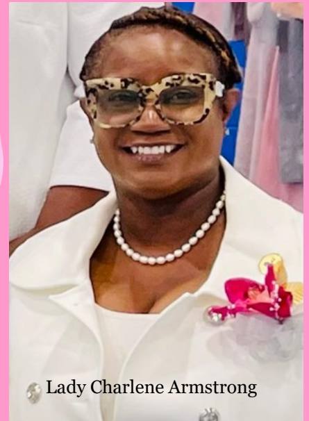
Lady Charlene Armstrong