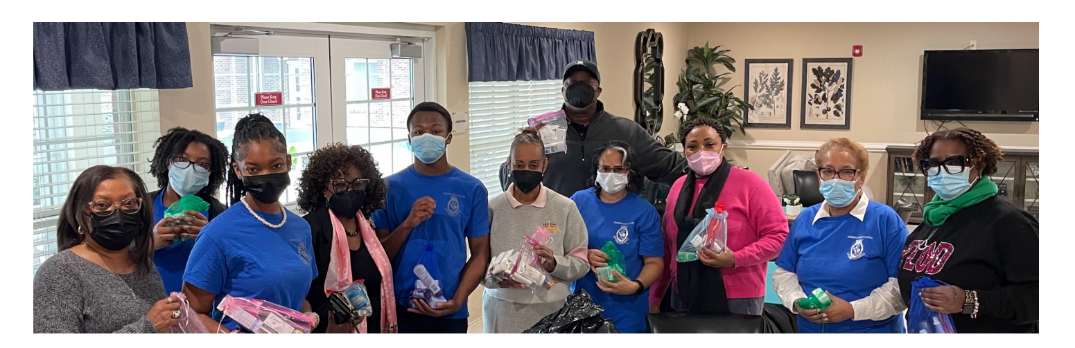
Pink and Blue MLK Day of Service: Guilford County Top Ladies and Top Teens distributed bags of toiletries to senior citizens at Camden Health and Rehabilitation Center